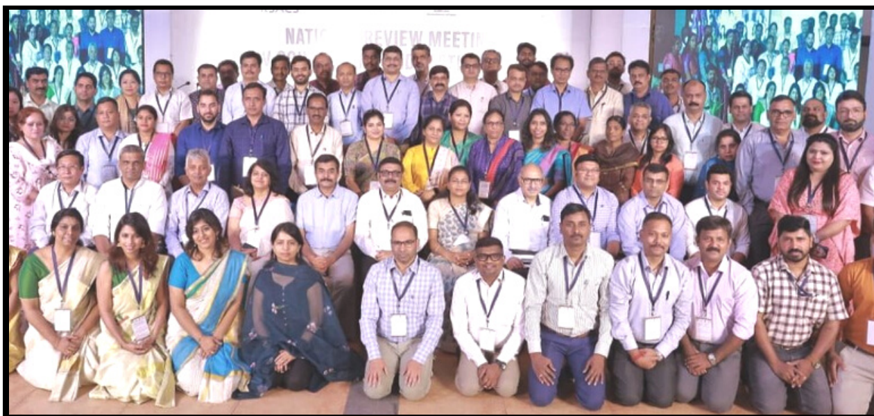
NACO Review meeting at Kovalam, Kerala